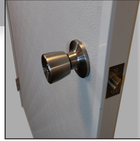
The 1800-Series features a capped edge panel for enhanced durability.