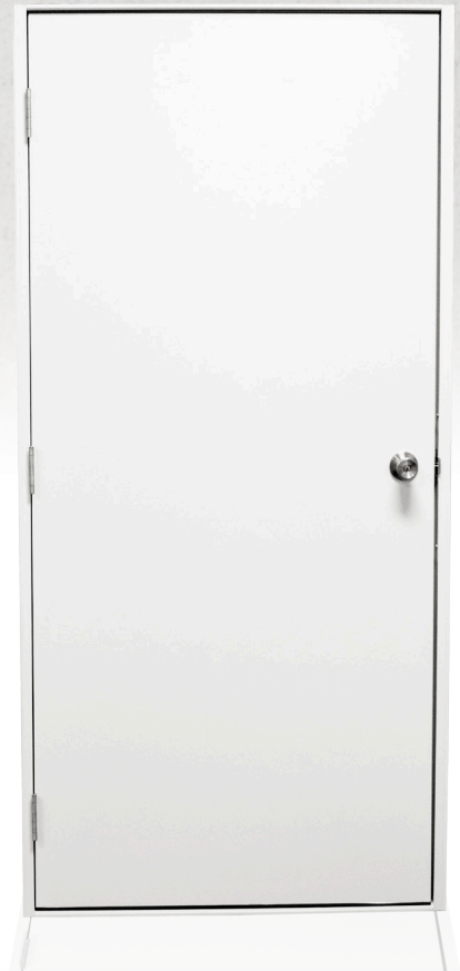
1700-Series (1734 and 1795)