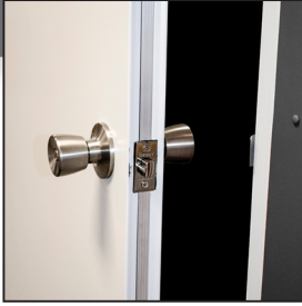
The rolled edge on the 1700-Series gives the door a commercial and finished look.