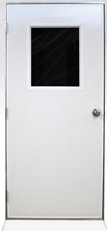
1800-Series (1852, 1853, 1872 and 1873)