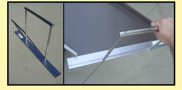
Wide Handle - 24" Tool

Serving the Metal Roofing Industry for over 28 years