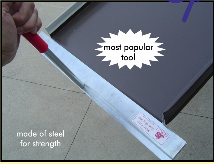
Single Handle Tool - Various Sizes Available (20",19",17.25",15.25",11.25")