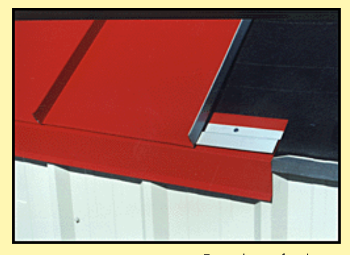
Form the perfect hem

Our tools will save installers of metal roofing time associated with properly field-bending the ends of the metal roofing panels. We offer tool sizes to accommodate all panel widths. Whether you want to hem the low side or close the high side, JS Design has the right tool for your application.